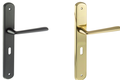
Product Finish Pictured: Matt Black & Polished Brass